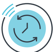
Cycle time selector