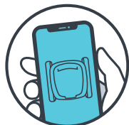
Set & forget, control your robot from anywhere