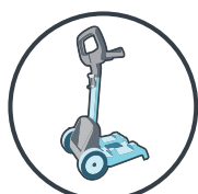
Caddy for storage and handling