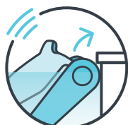
Pick me up mode